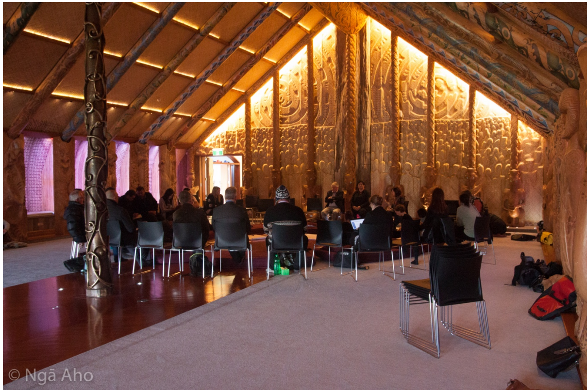
Better Urban Planning wānanga, Te Noho Kotahitanga, Unitec, June 2016

Historically, urban planning has disconnected mana whenua from the taonga we cherish, and made Māori identity invisible within the built environment.