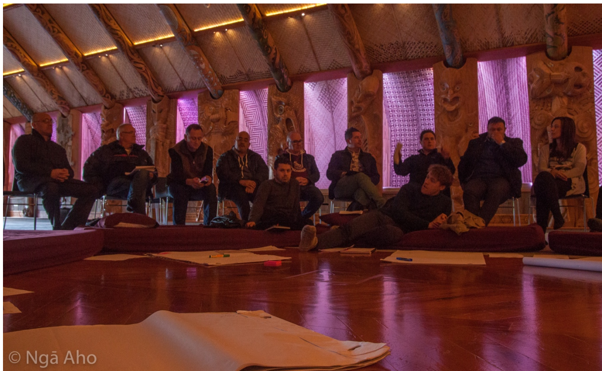
Better Urban Planning wānanga, Te Noho Kotahitanga, Unitec, June 2016

The Māori economic landscape has changed considerably in the last decade and will continue to do so as more Iwi settle their treaty claims and their economic base grows. Also, Treaty settlements are seeing the emergence of new institutional arrangements, specifically co-governance, with co-management entities and joint management agreements being established to support decision makers and sharing duties and functions with local authorities in managing New Zealand's resources. Relationship and partnership agreements between organisations and Iwi are also increasing and becoming common practice. There currently exists a wide network of grass roots practitioners (tāngata whenua and/or kaitiaki) working at the marae, community, iwi, hapū and runanga level. Invariably these practitioners have a broad range of planning and resource management experience and juggle other responsibilities. Many do not have formal planning qualifications as recognised by NZPI but play a significant role in the planning scene. Ultimately they all seek similar outcomes, namely practicing kaitiakitanga within their respective rohe (traditional iwi and hapū boundaries) through the application of tikanga and kawa, which is sourced from mātauranga Māori. Alongside our role in the NZPI, Papa Pounamu will seek to target these grass roots practitioners, to ensure that there are opportunities for information sharing, networking, debate and discussion.