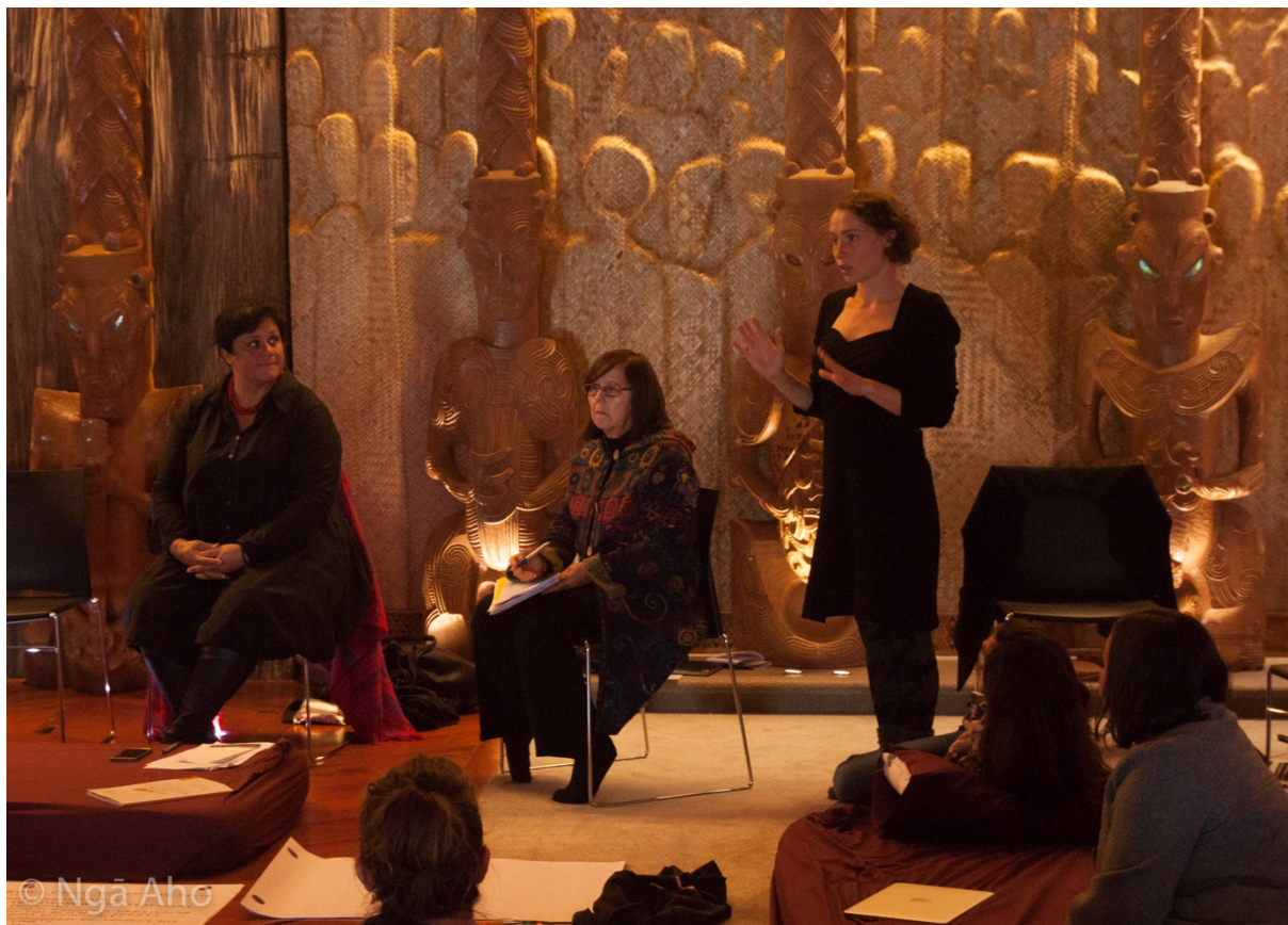
Better Urban Planning wānanga, Te Noho Kotahitanga, Unitec, June 2016